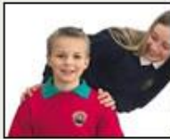
Crew Neck Sweatshirt