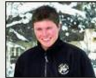
Brigade Fleece Jackets

Welcome > Your School's Page > Crew Neck Sweatshirt