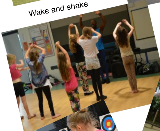
Wake and shake