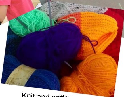
Knit and natter